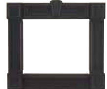
Cast-iron surround with decorative keystone