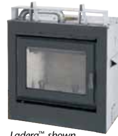
Ladera™ shown with black door

The Dave Lennox Signature™ Collection Ladera™ high-efficiency wood-burning fireplace is a contemporary marvel. Advanced features, like a Double-Air Combustion control, allow you to enjoy a continuous fire without the need for reignites and help optimize efficiency. A compact, yet open, firebox accepts logs up to 18" for large flames, long burn times and additional warmth. And with a clean-face design and expansive viewing area, this EPA-certified fireplace allows you to take pleasure in the modern beauty of an unobstructed fire with a true masonry fireplace feel.