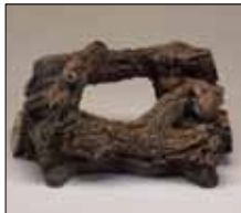
Decorative log set