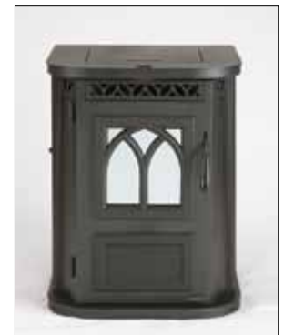
Cast-iron Gothic Arch