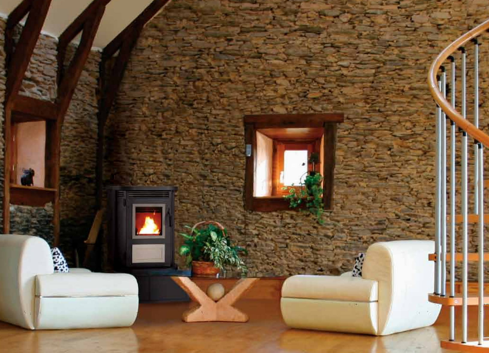
Montage™ shown with Contemporary trim kit

■ The Montage™ pellet stove is truly designed for modern times. With four distinct trim kits, the Montage can be customized to fit nearly any décor. Because the large hopper and automatic feed system erase the need for steady fire maintenance, using the stove is easy, unproblematic and economical. In fact, the Montage effectively burns standard-grade fuel, saving expense while delivering dependable, low-maintenance heat. This stove is the ultimate in modern comfort—beauty, efficiency and, above all, performance. ■