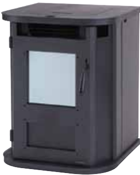
Montage™ pellet stove shown without required trim kit